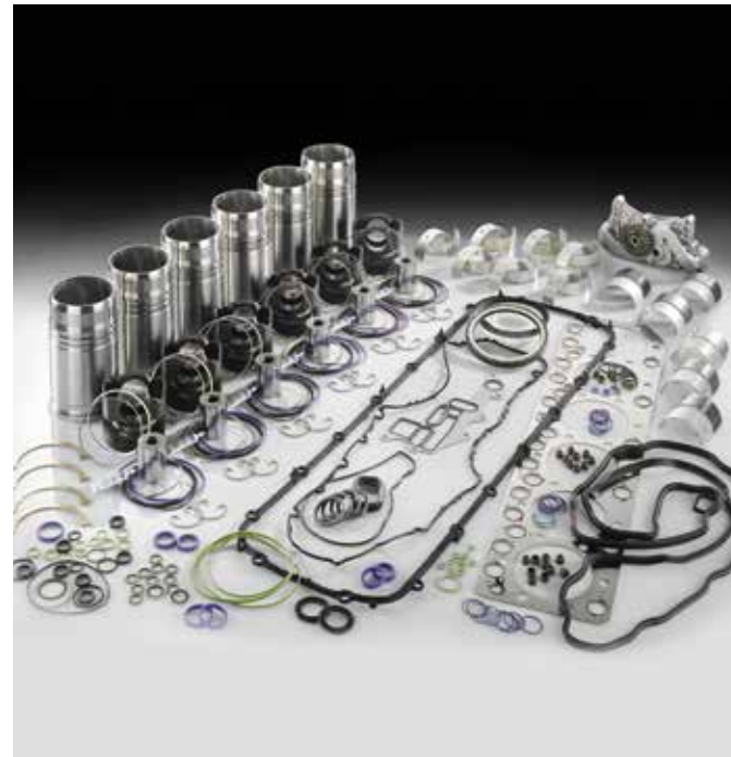
All parts included in the kit